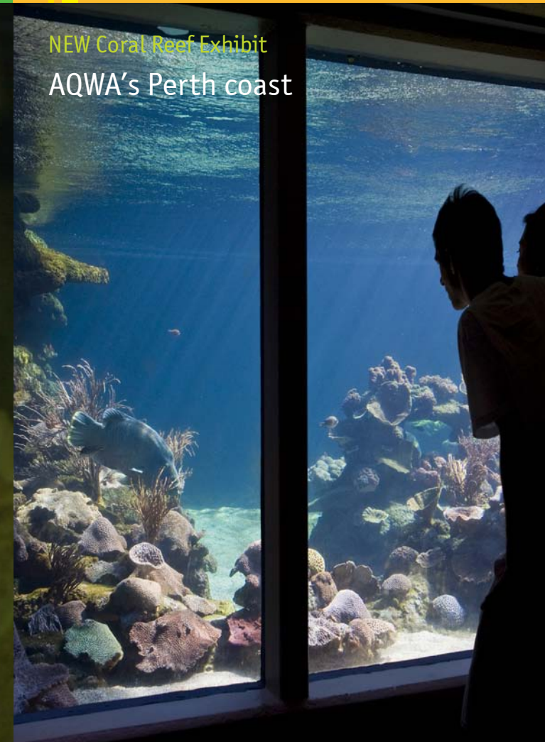
NEW Coral Reef Exhibit AQWA's Perth coast