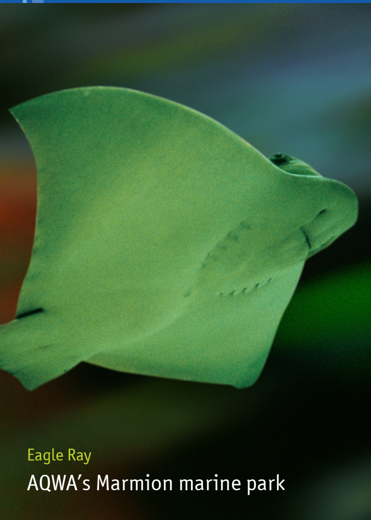
Eagle Ray AQWA's Marmion marine park