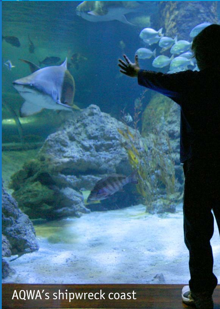
AQWA's shipwreck coast

Leafy Seadragon AQWA's great southern coast