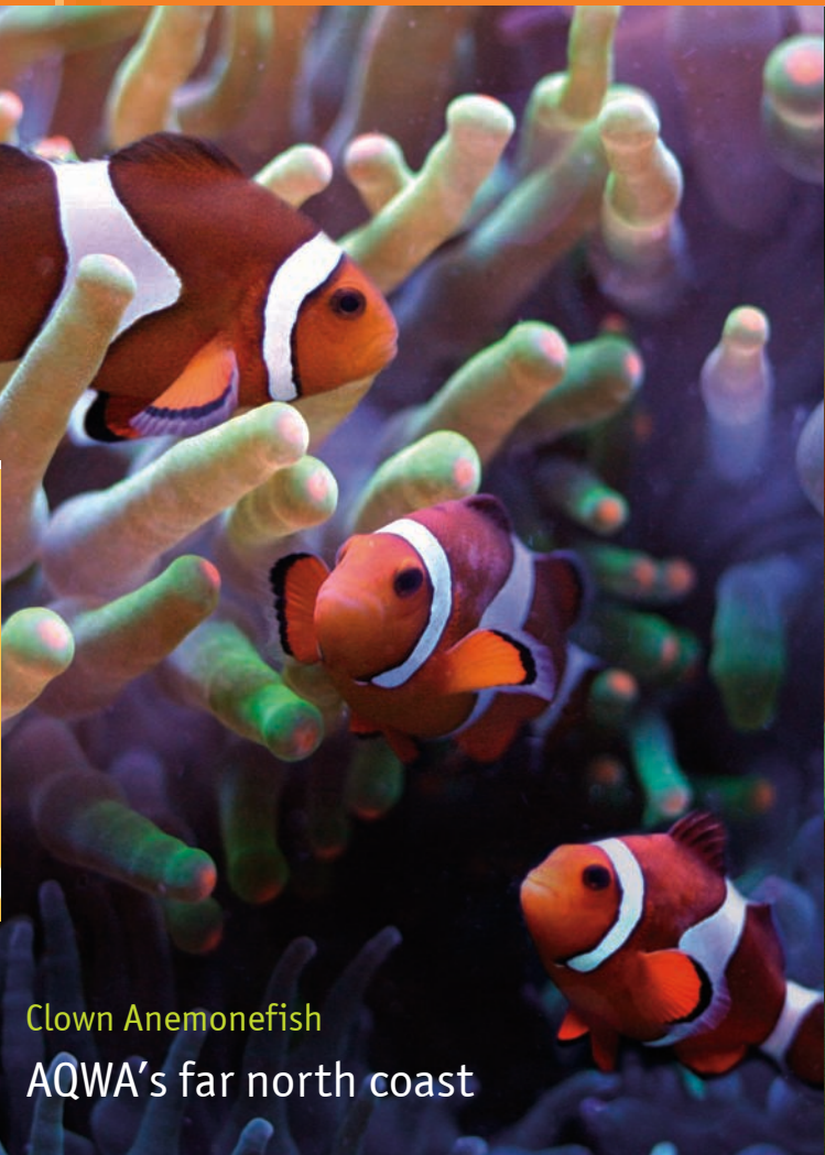
Clown Anemonefish AQWA's far north coast